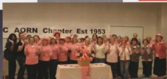
Ready for the Parade & Pink Glove Dance