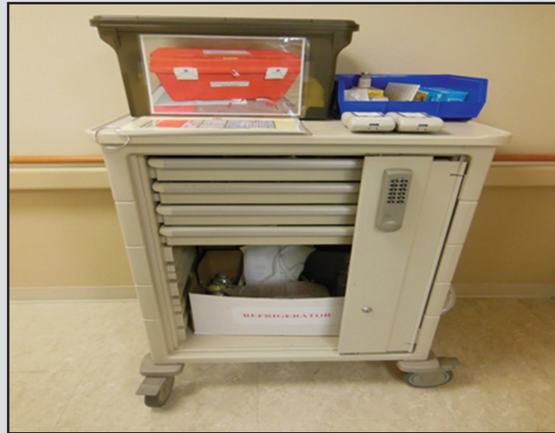
Example: Malignant hyperthermia cart