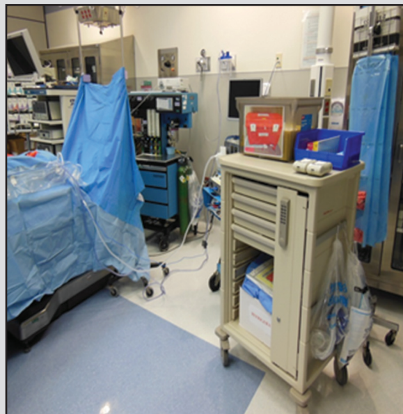
Example: Room set up